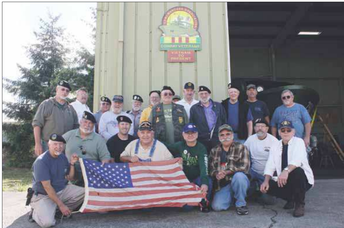
Members of the Gamewardens Association gather for a portrait Saturday under their logo on the outside of a warehouse they are renting on Habein Road in Chehalis.